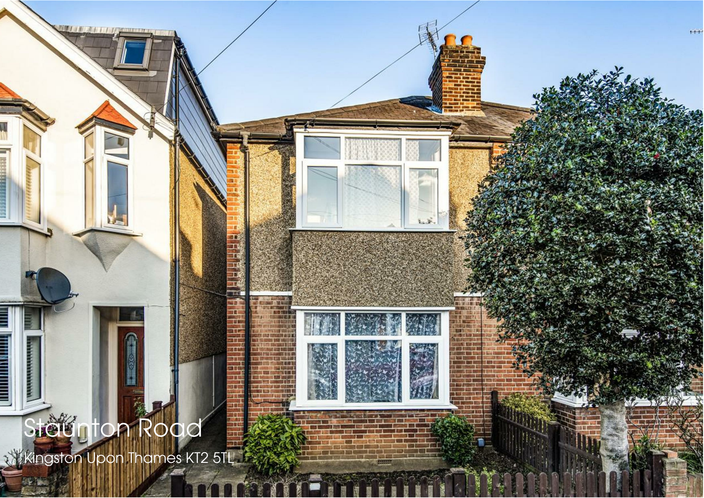
Staunton Road Kingston Upon Thames KT2 5TL